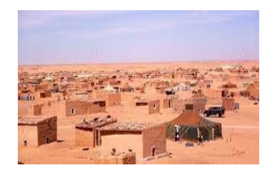
Dakhla in 2021